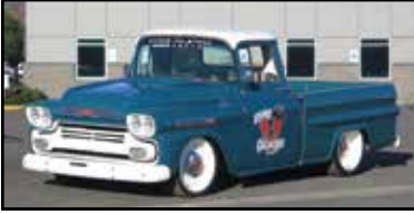
1959 Chevy truck built by Chris Holstrom Concepts