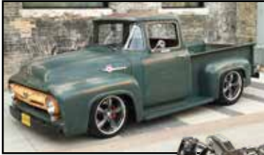
Ken Wiebe, 1956 Ford F100