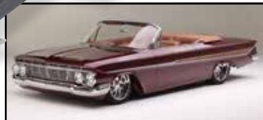
Hot Rods & Custom Stuff 1961 Impala