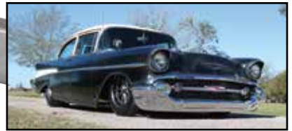
Barn find 57 with original paint. Built by David Strom Jr. Uses 4-link rear clip

Art Morrison's 4-link rear suspensions are perfect for competition or street applications where maximum adjustability is desired. There are six upper bar front mounts plus four lower bar attachment holes, along with two top and bottom housing mounts and adjustable bars to provide you with any "instant center" point desired.