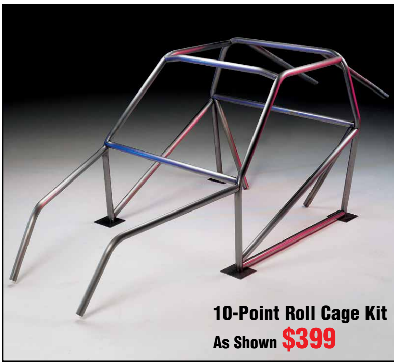
10-Point Roll Cage Kit As Shown $399