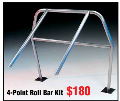
4-Point Roll Bar Kit $180

20306901 Black Roll Bar Padding, 3' Length . . . $10.00