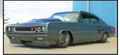
1966 Charger built by Garret's Rod Shop

option is a 4-bar rear suspension with a Panhard bar. A 20:1 power rack and pinion steering is standard on all MaxG chassis.