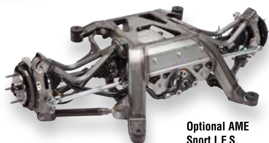
Optional AME Sport I.F.S.